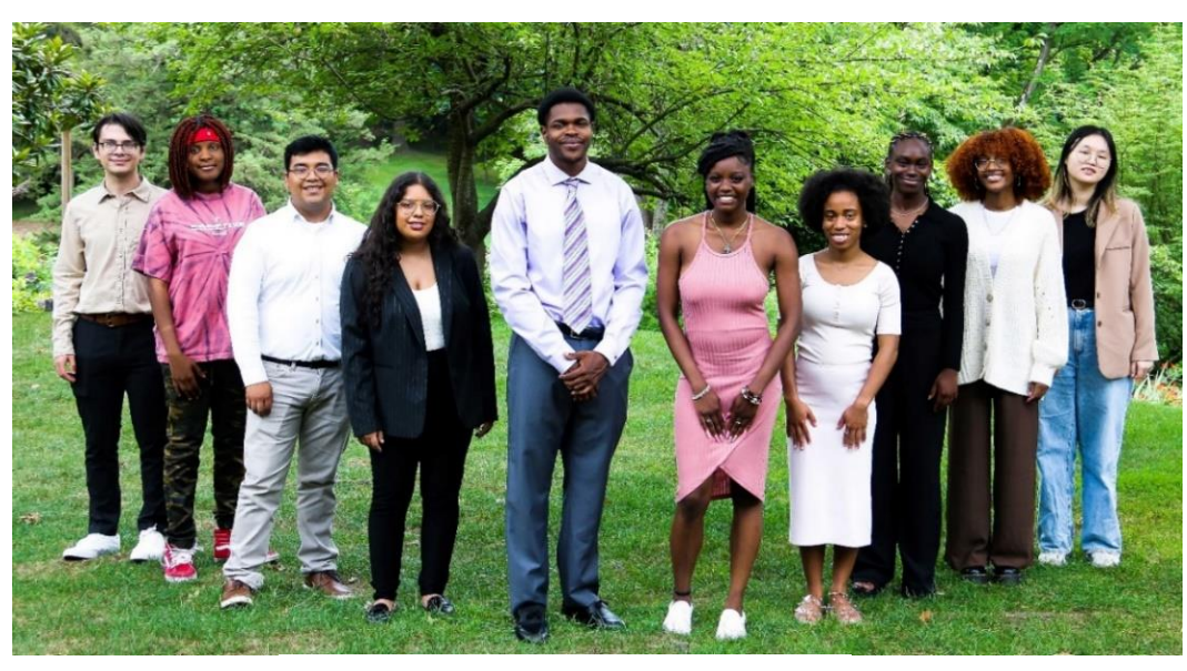
2022 New Jersey interns