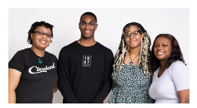
Cleveland State students as 2022 Eleven+ interns